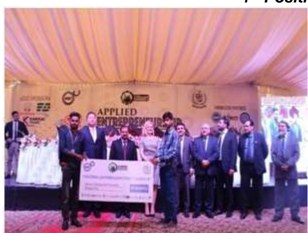
Project Name: CNC Machine by PITAC College of Technology (PCT) 2<sup>nd</sup> Runner up