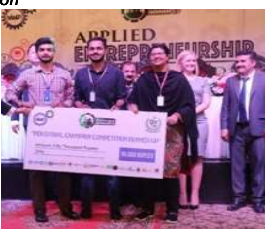
Project Name: Code Ranker by University of Management & Technology (UMT) 1<sup>st</sup> Runner up