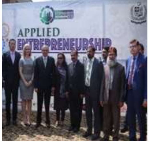
Speakers & Dignitaries